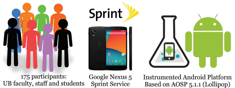
FIGURE 2. An Overview of PhoneLab

After an experiment clears the testing process, we distribute it to participants using the same over-the-air (OTA) platform update capabilities provided by Android devices and commonly used by wireless carriers. Once a platform update is stored